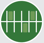
PARKING LOT LIGHTING

The EG Series provides a durable solar lighting solution in a sleek, self-contained package. The integrated system offers exceptional lighting quality for outdoor applications.