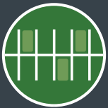
PARKING LOT LIGHTING

The Top of Pole Series is an efficient outdoor lighting solution. Customizable features meet your specific lighting requirements while keeping costs to a minimum.